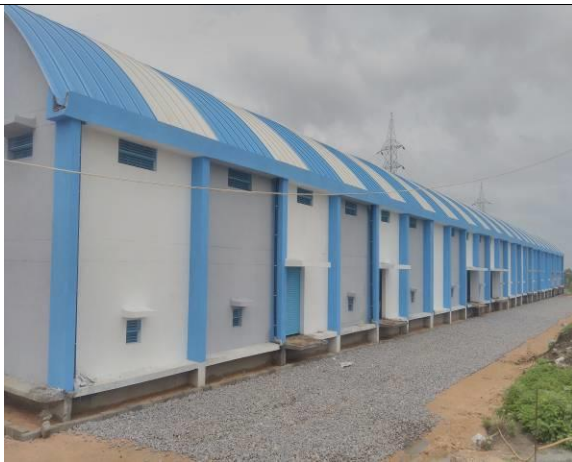
VIEW OF THE 5000MT SCIENTIFIC GODOWN FACILITY