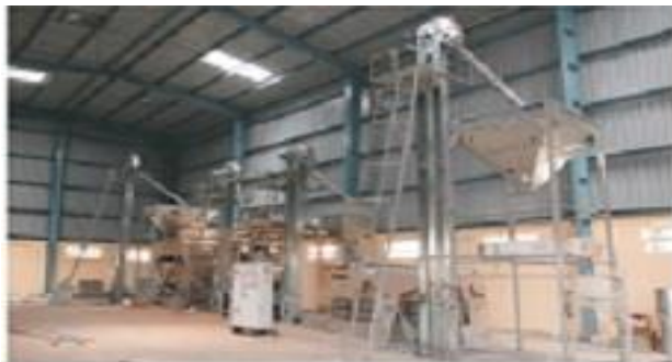
INSIDE VIEW OF PROCESSING UNIT