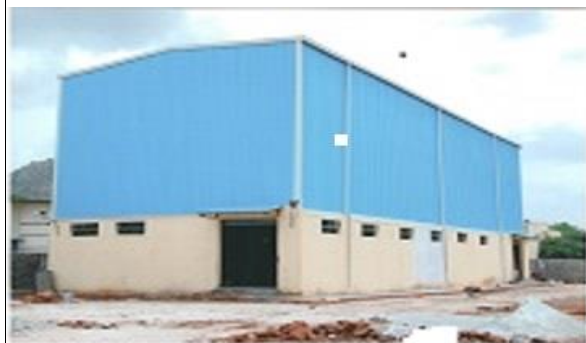
OUTER VIEW OF PROCESSING UNIT