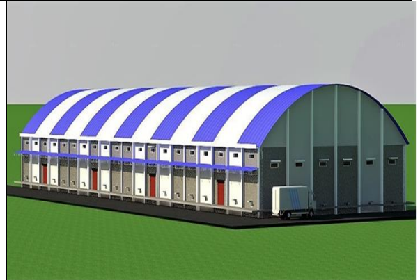
VIEW OF GODOWN